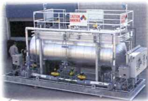
NH 3 vaporization / dilution skid

Our Environmental Systems Group is a recognized leader in the design and supply of both aqueous and anhydrous SCR reagent supply systems. Our designs address both on-site physical requirements and the economic considerations of clients working to gain compliance with NO x emission.