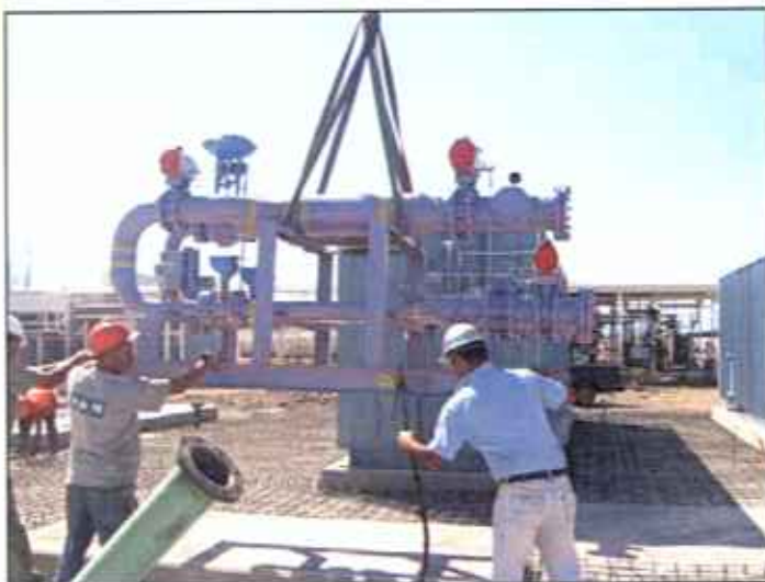
AFC™ being lowered into place in Maipo, Chile

In the last 7 years, Ely Energy has been selected for nearly EVERY utility peak shaving or city gas installation that has been built in So. America. Congratulations to all involved and to all our local partners!