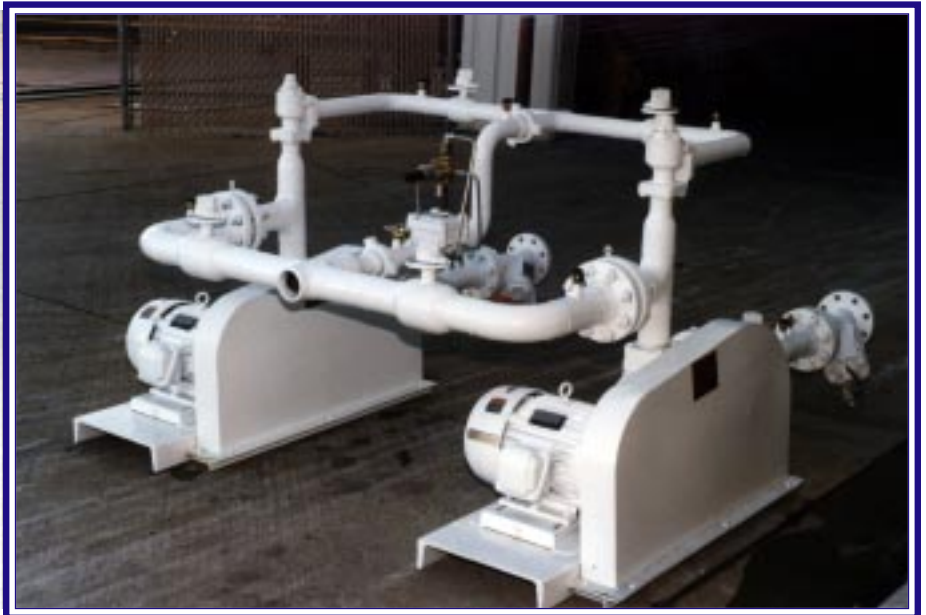
Duplex 2" Pump Package Shown